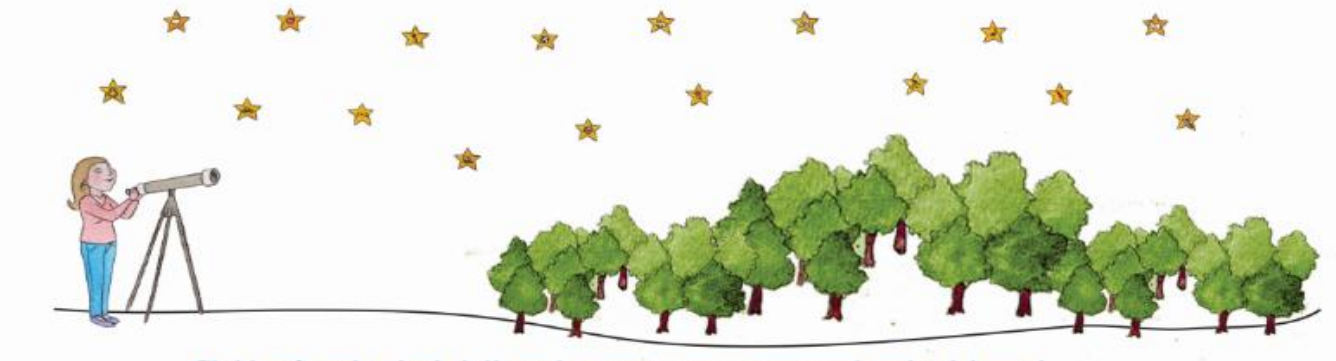
Children's individual skills and interests are encouraged and celebrated

Prospective parents are welcome to visit the school by appointment through the School Office.